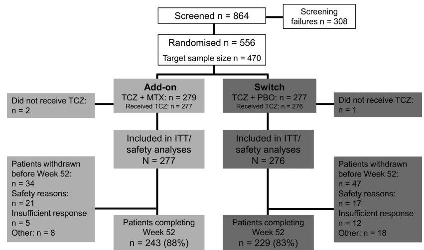
Figure 1 Patient disposition and study flow chart. ITT, intention-to-treat; MTX, methotrexate; PBO, placebo; TCZ, tocilizumab.

Both patient groups were well matched for baseline characteristics, except for a difference in GSS (which did not affect outcomes; table 1).