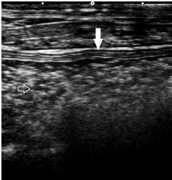
Fig 1. Image of the colon. Layering within the colon wall (solid arrow) and echoic ingesta (outlined arrow). Each diamond-shaped marker represents 1 cm.

the sonographer during the ultrasound examination, and confirmed in at least 2 digitally stored still images and 1 video clip from each case by 3 investigators reviewing the images. There was no difference in age, intestinal wall thicknesses, duodenal or jejunal motility or presence of meconium between foals with and without intussusceptions (Table 3). The intussusciens was significantly ( P < .01 ) thinner (1.9 \pm 0.1 mm) than the normal jejunum (2.5 \pm 0.1 mm). There were no differences between normal jejunal measurements and the intussusceptum (2.6 \pm 0.9 mm). None of the measurements were over the upper end of the reference range described for the overall population (3.1 mm) and in 4 cases, the intussusciens was 0.1–0.2 mm thinner than the lower end of the reference range for the general population (1.9 mm).