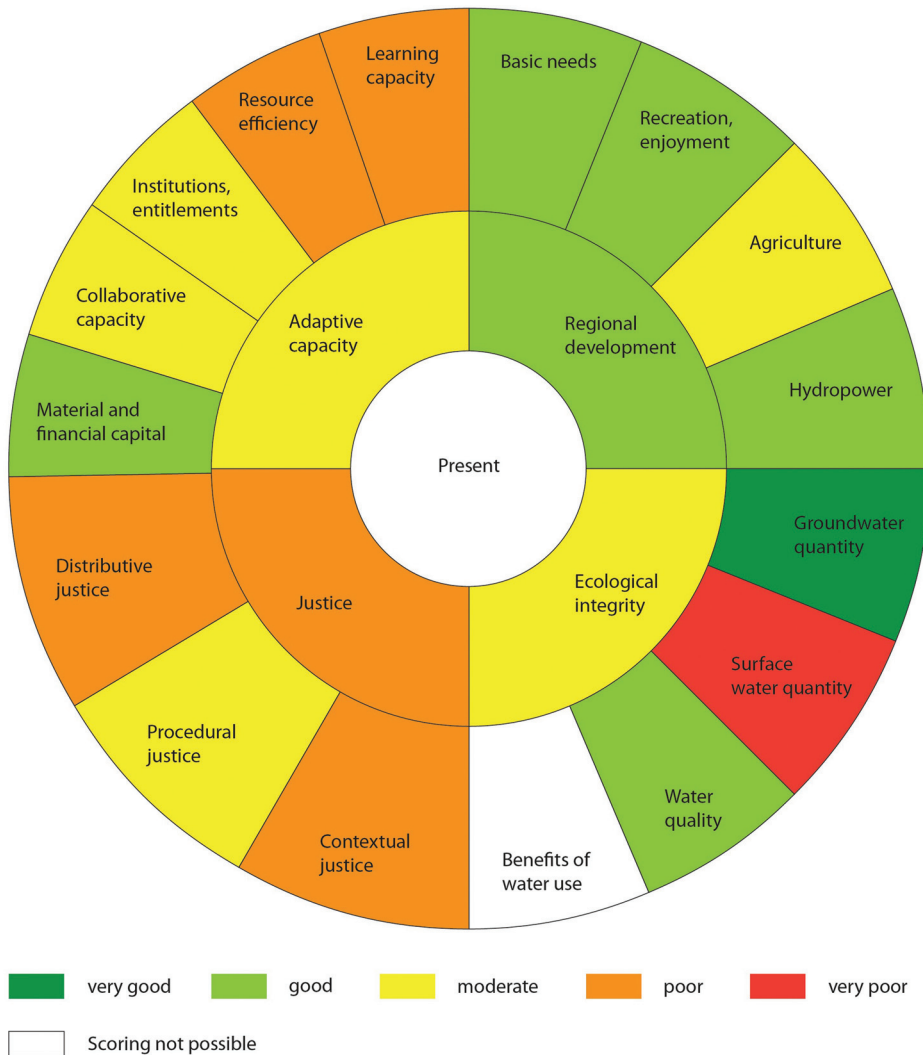
Figure 3. The sustainability wheel for the present for the Crans-Montana-Sierre region. See online color version for full interpretation.

not always exist in writing; therefore, during some periods (winter low discharge months, dry periods in summer) there is always the risk for the dependent communes to face shortages. Moreover, during some dry periods, some communes use the water held in reserve for fighting fire for drinking water distribution (Schneider and Homewood 2013).