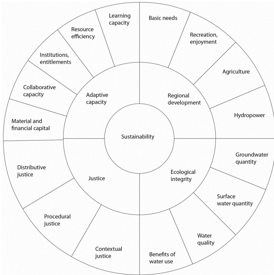
Figure 2. The sustainability wheel for the water governance system in Crans-Montana-Sierre.

water to achieve society's goals of regional development (scored as good); however, its performance regarding ecological integrity, adaptive capacity (both scored as moderate), and especially regarding justice (scored as poor) is more limited.