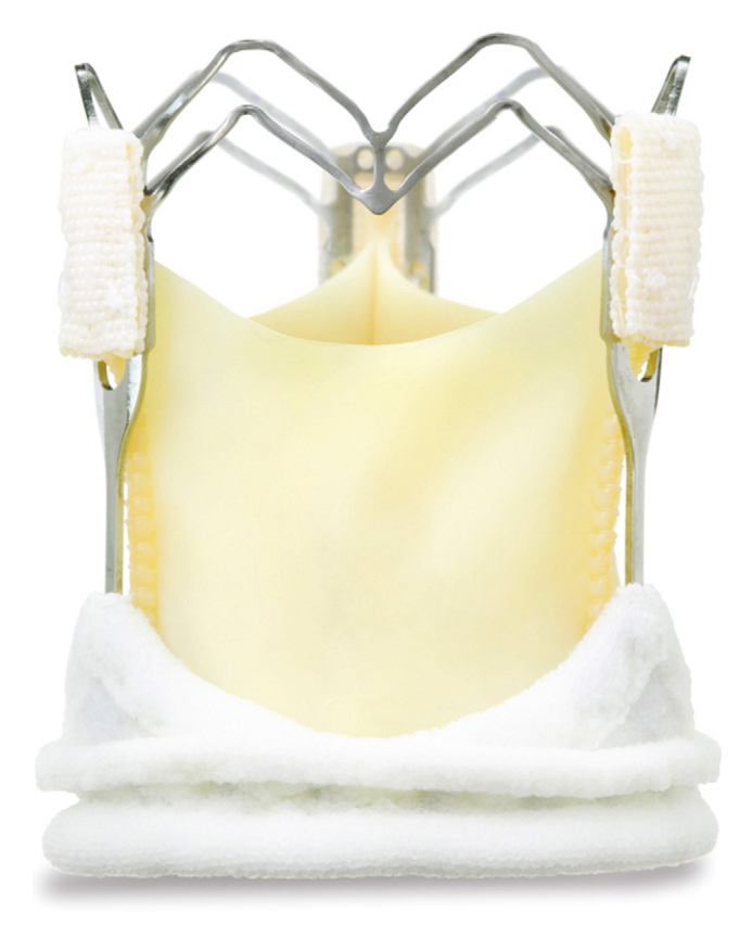
Fig. 1. Photo of the ATS 3f Enable® Aortic Bioprosthesis Model 6000.

The device is assembled from three equal sections of equine pericardial tissue using locking sutures (Fig. 1). The interlocking, adjacent leaflets form a tubular structure and result in three, equally spaced commissural tabs that are reinforced with polyester material. All equine tissues are pre-treated with glutaraldehyde under specific conditions (e.g., critical treatment time, pH, and temperature). This