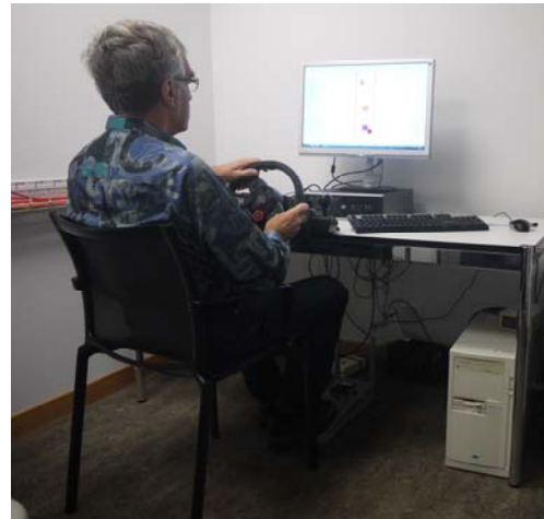
Fig. 1 Setup of the BCST with screen, steering-wheel, and foot-pedal.

In order to correct for multiple testing, whenever possible multivariate analyses were performed. Variables with interval scale were analyzed using MANOVA (multivariate analysis of variance) or a Friedman's test if conditions for the MANOVA were