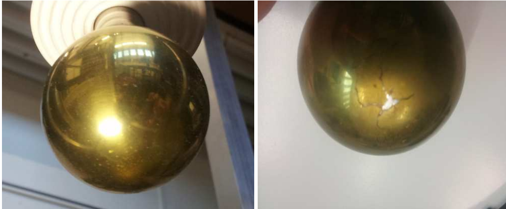
Figure 2. Left: a 200 \mu\text{m} thick layer of natural polyisoprene deposited on the surface of a steel cathode sphere of 5 cm diameter. Right: layer damage after a discharge breakdown occurred.

leaching phase is crucial in order to remove all soluble pollutants contained in the natural latex milk. Vulcanization increases tear strength of the polymer layer.