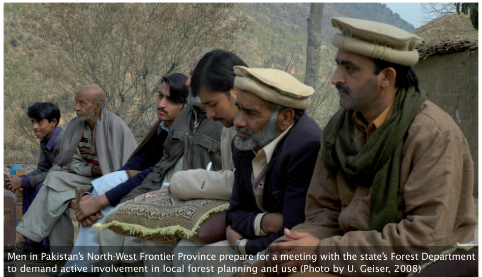
Men in Pakistan's North-West Frontier Province prepare for a meeting with the state's Forest Department to demand active involvement in local forest planning and use