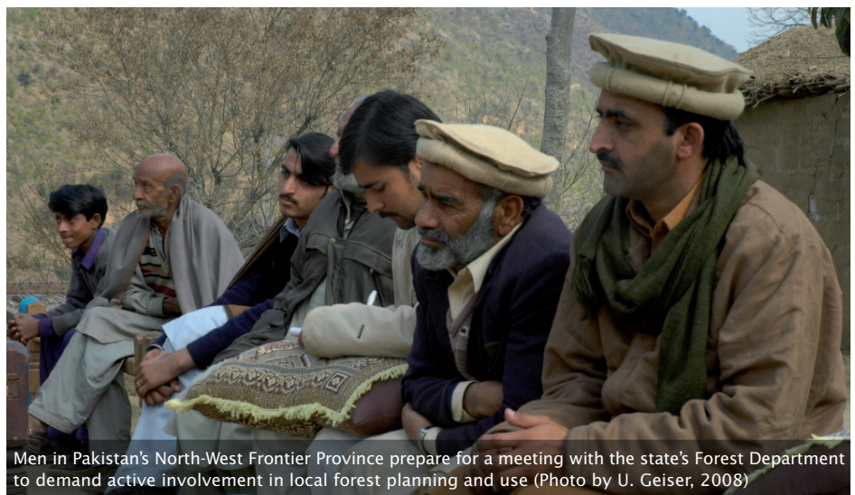
Men in Pakistan's North-West Frontier Province prepare for a meeting with the state's Forest Department to demand active involvement in local forest planning and use