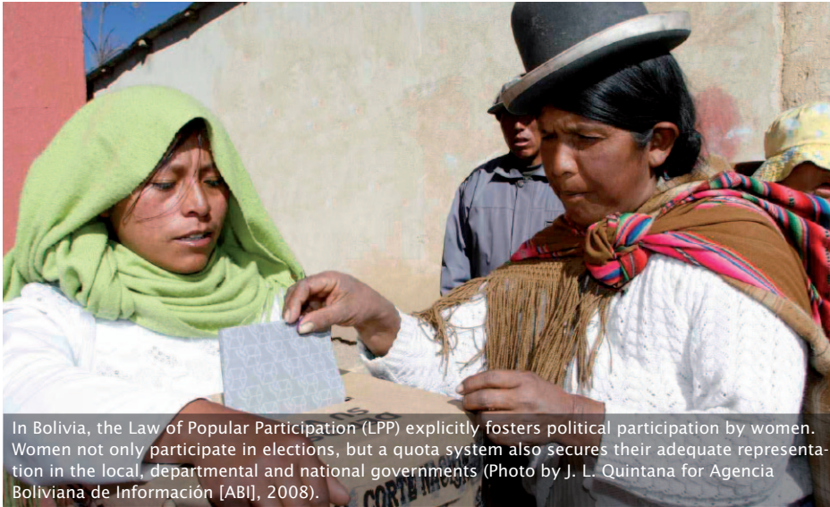
In Bolivia, the Law of Popular Participation (LPP) explicitly fosters political participation by women. Women not only participate in elections, but a quota system also secures their adequate representation in the local, departmental and national governments (Photo by J. L. Quintana for Agencia Boliviana de Información [ABI], 2008).