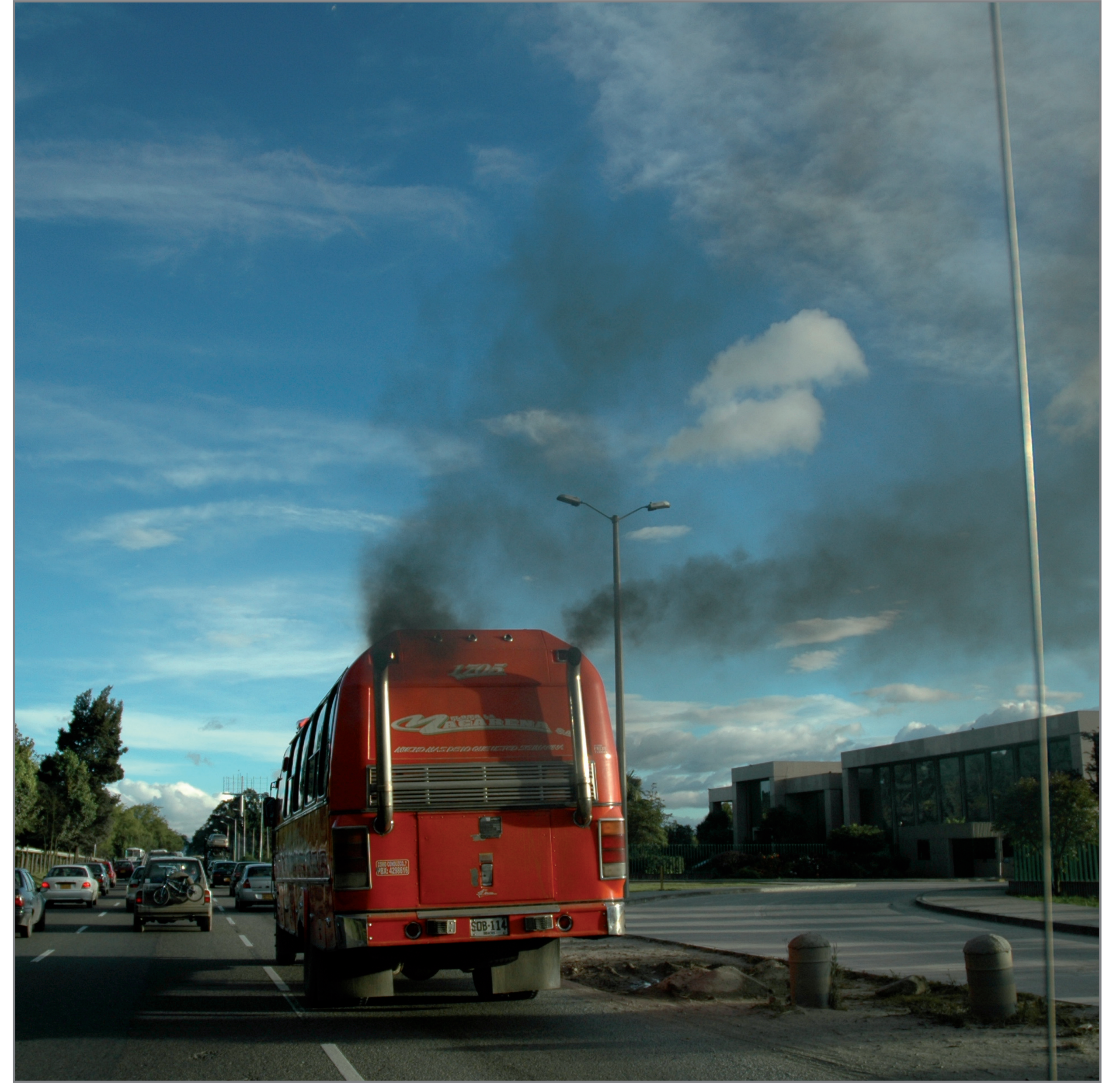
Figure 1: Air pollution and related traffic emissions in Bogotá, Colombia (C. Misteli, left, and M. Ossés, right).