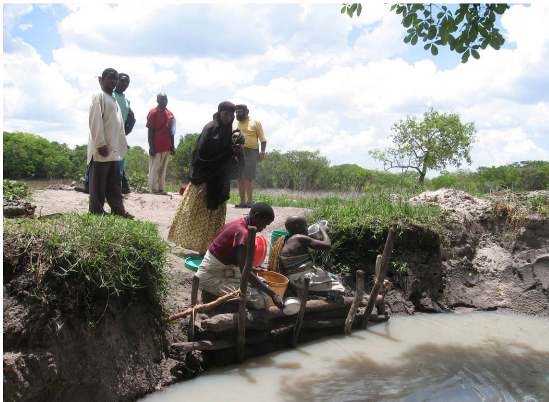
Figure 7 Resource management in all sectors is far from sustainable. Sustainability must respond to basic needs, be based on local knowledge, and relate to the activities of the local population.

A corollary of this low productivity is the expansion of cultivated areas , as indicated by the extensive use of slash-and-burn practices to establish agricultural plots. Interestingly, it seems that land availability is not a constraint within the territory of the concession, which makes the issue of land use change by way of extensification an even more pressing concern in terms of sustainable use of resources.