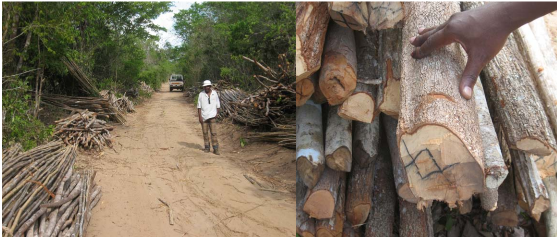
Figure 3 These pictures were taken in mid November 2009 in the COMADEL forest concession exploited by Miti Ltd. They show commercial exploitation by informal operators (not known to Miti Ltd.), who nevertheless cut, transport (on the road constructed by Miti Ltd.) and trade construction material, most likely for customers in Mocimboa da Praia.

The owner of Miti Ltd. is well aware that successful exploitation of the COMADEL concession relies heavily on cooperation with the communities living in its territory. Moreover, this ESAPP project is motivated by the request of the owner of Miti Ltd. himself to have access to more information on natural resource users and usages, with the aim of having more harmonious relations with the communities. This constitutes a very important entry point for action research, as one of the key elements for achieving sustainable use of resources is for all actors to be aware of the social, ecological, economic, cultural and political factors underlying access to and use of these resources. It is usually argued that logging companies only extract resources with little regard for regeneration potential, including the social conditions underlying this potential. In this case, the fact that the owner of the logging company himself strongly expresses how aware he is that any enhancement of forest management is highly dependent on cooperation between the population living in the concessions, the local authorities and the logging company, is a very valuable factor that must be further explored. This represents a very important venue for transforming potential conflicts over resource use into mutually beneficial situations.