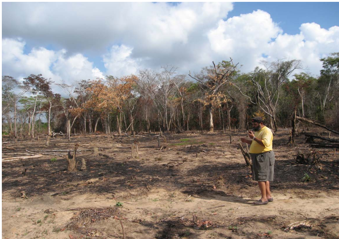
Figure 8 Livelihoods are directly threatened by unresolved conflicts between men and animals that result in food insecurity and violation of the Wildlife Law (as these traps are illegal) and missed opportunities for legal revenues at the community level (proceeds from the hunting licence fees).

These conflicts with wildlife cannot be solved in the absence of a clear understanding by the population of the role and competence of District authorities in managing and applying hunting quotas through operators (in this case Antamozambique). Information regarding the right of the community to benefit from each animal that has been hunted on its territory is not clear to the community and should be clearly spelt out by the relevant level of authority. In other words, the community and other relevant actors at the village level (such as the Natural resources management committee) need to have the law and its implications explained, particularly with respect to the proceeds from the “20% of the hunting licence fee” to the communities.