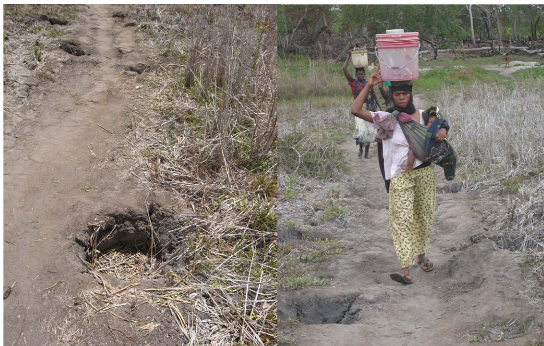
Figure 11 Elephants often destroy crops before the yield. The footprints here indicate that this was the case in this paddy field at the end of the last rainy season.