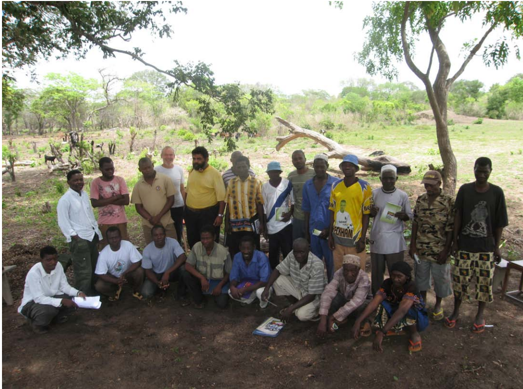
Figure 6 Participants at the workshop in Namiune

It should be noted that the leader of an auditing group from the national level, in a mission to control the timber park of Miti Ltd. (namely the former Director of Agriculture in Cabo Delgado), expressed his interest in participating in future LforS workshops.