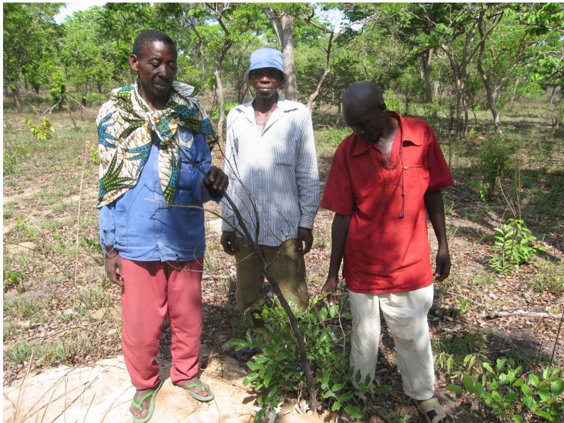
Figure 13 Bushfire is obviously a limiting factor for the forest regeneration; trees need a period of about 3 to 5 years with little disturbances to grow big enough to survive a bushfire.