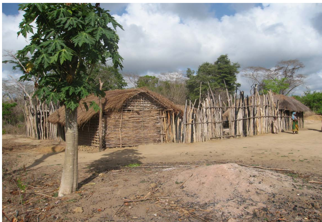
Figure 12 Settlements in the concession show the will of the population to gain access to resources despite the difficulties of settlement in the forests.

The fact that the territorial limits of the concession are not well established by the logging company is a potential source of social conflict because communities could claim to have the right to 20% of the proceeds to which they are entitled by law. In addition to poor territorial limitation of the concession, there is widespread establishment of new villages to benefit from the 20% tax revenue (applicable to a community with a minimum of 500 persons). This indicates a need to update the population registry.