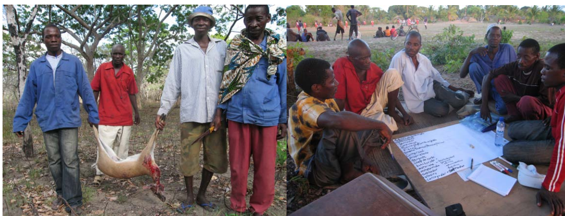
Figure 4 During the workshop, the research team was exposed to the LforS participants' daily activities, such as making use of wildlife, as a way to establish a common understanding of the situation and preferences in terms of coping strategies.

Community: as can be seen from the list of participants in the annex, there was a good representation of village dwellers, whose livelihood strategies are based on diversification of activities and income sources. The majority of dwellers practiced agricultural production – mostly for household subsistence – combined with other activities that rely on the forest, such as exploitation of non-timber forest products (plants collected for food, medicinal use or construction material) and exploitation of timber on the basis of simple licences (only for local transformation and use within the concession). Many dwellers also hunt wildlife, declaring that they use the meat for their own consumption rather than for commercial purposes, which requires a hunting licence).