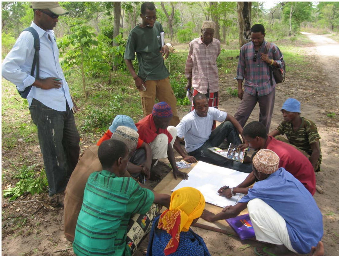
Figure 5 Intensive discussion among local participants under observation of national researchers

Authorities: as far as official authorities were concerned, the provincial level was clearly under-represented, with only two controllers of the provincial Department of Forest and Wildlife partially attending the workshop. At the district level, only one representative of the department of Agriculture and Economic Development was present.