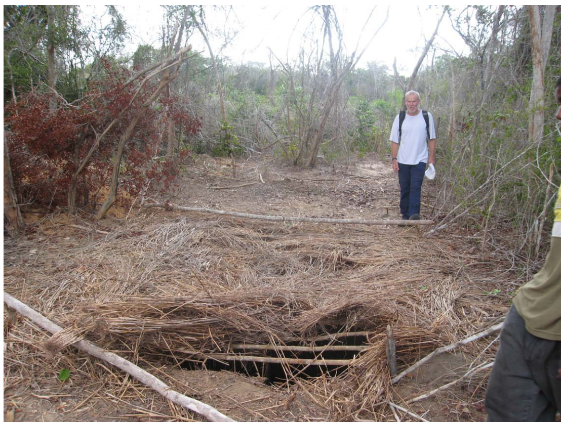
Figure 9 2008 Two elephants have already been caught in this pit-fall and slaughtered

The concession is exploited on the basis of management plans, drawing on the rough assessment of timber potential made by the concessionary. These estimates are characterised by a very high level of uncertainty, due to the fact that very little is known about the history of degradation/ deforestation (i.e. prior to the establishment of the concession). This is combined with the fact that the current data basis for the management plan and the underlying statistical extrapolation are weak, all of which contributes to the increased uncertainty of the potential estimates.