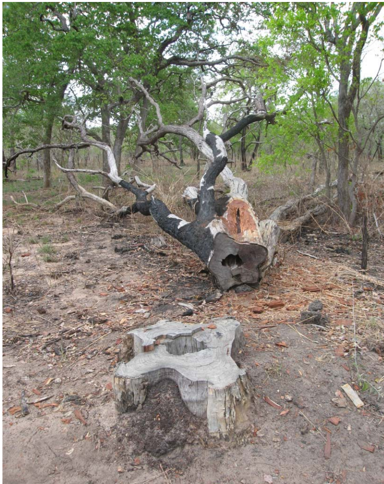
Figure 10 Often it is impossible to know who is exploiting the forest; every stakeholder group blames the others

The training of official community inspectors to fill the gap left by official inspectors (as defined in the Law, but not functioning in reality) would be a simple step towards improving control. In this sense, the concessionary could benefit from the skills of the “olheiros” (traditionally paid to identify mother plants, but unemployed during the resting period) to substitute for the official inspector.