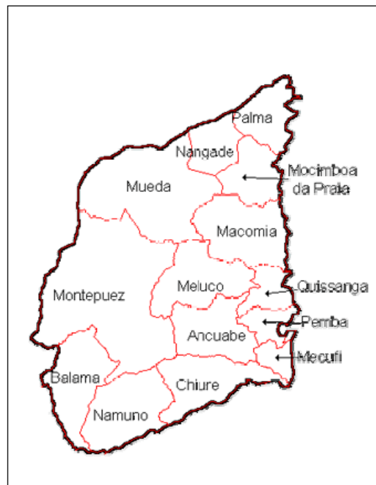
Figure 2 Map of Cabo Delgado

The District of Nangade borders Tanzania and covers 3,031 km 2 with 63,739 inhabitants. The population of Namiune is 1,085 (information from the village Secretary), which represents a rather small portion of the total population of the District. Nevertheless, it is rather surprising to find such a significant number of people living, farming and gathering inside the concession, given that the process of delimitation usually keeps villages out of forest concessions to reduce potential sources of conflict. The situation seems to be attractive enough to support people's livelihoods, despite numerous complaints about wildlife disturbing agricultural production. In fact, it seems that the tendency is for people from other villages to establish villages within the borders of the concession in order to benefit from the 20% of forest tax revenues. Yet data on population growth within the limits of the concession are not provided on a regular basis by the local authorities. The population in the village of Namiune is quite diverse in terms of places of origin, but two major ethnic groups dominate the village and live in distinct quarters (see report by Prof. Adam et al. for more information).