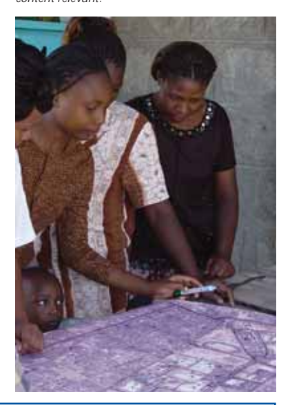
Potentials, Limitations and Risks of Geo-Information Technology for Sustainable Development Approaches in Kenya www.cde.unibe.ch/CDE/ PubMed_Detail2_CD.asp?ID=1073

Nakuru Local Urban Observatory: Involving stakeholders in data generation helps to keep content relevant.