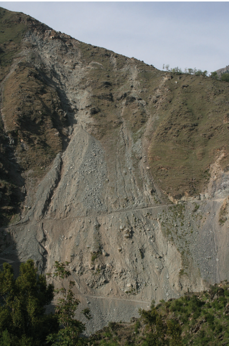
FIGURE 3 Landslide affecting the road to the upper Chakhama Valley. (4 April 2007)