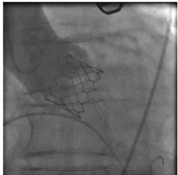
Figure 1. Aortic root angiogram after Sapien 3 transcatheter heart valve implantation. The Sapien 3 transcatheter heart valve comprises a balloon expandable, cobalt chromium frame, a trileaflet bovine pericardial tissue valve, and a polyethylene terephthalate (PET) skirt. The outer PET cuff was designed to improve paravalvular sealing.