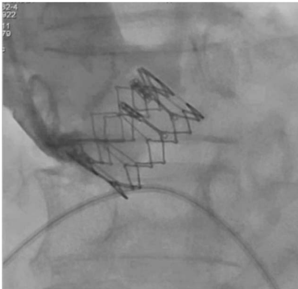
Figure 2. Aortic root angiogram after Sapien XT transcatheter heart valve implantation. The Sapien XT transcatheter heart valve is approved for the treatment of symptomatic severe aortic stenosis in patients at high or prohibitive surgical risk. It comprises a balloon-expandable cobalt chromium frame, a trileaflet bovine pericardial tissue valve, and a polyethylene terephthalate inner skirt.

for outcomes with <10 events overall. Two-sided P values <0.05 were considered statistically significant. All analyses were performed with Stata version 14 (StataCorp, College Station, TX).