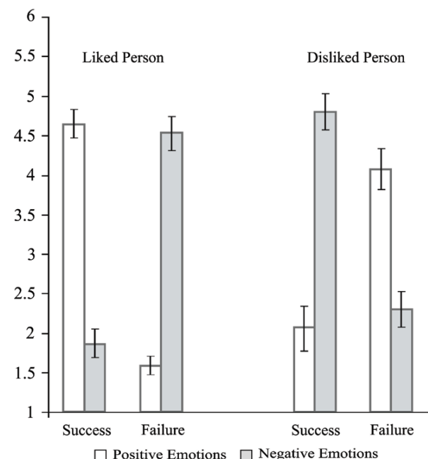
Figure 3. Intensity of positive and negative emotions to successes and failures of liked or disliked persons. Whiskers represent standard errors of the mean.

Note. * p < .05 , ** p < .01 , *** p < .001