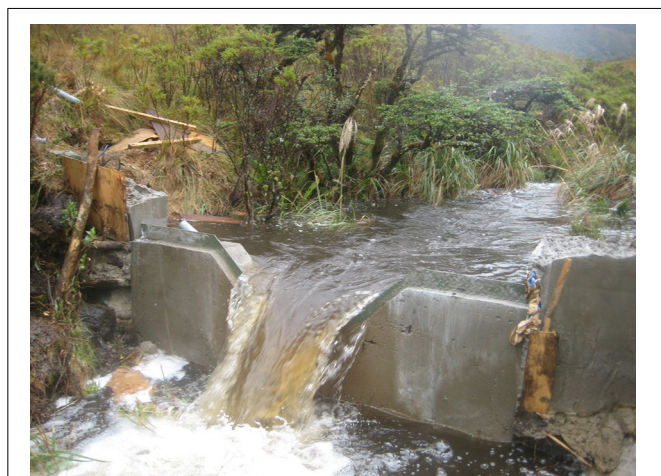
FIGURE 2 | V-notch weir for river flow measurements installed as part of the iMHEA monitoring network in the Peruvian Andes.

A main problem is the disconnect between the governmental or donor recommended practices and what farmers are willing to maintain voluntarily without governmental interventions. For instance, government agencies recommend the installation of 60 cm deep and 30–40 cm wide swales on the contour to intercept excess rainfall and to allow it infiltrate into the subsoil. In contrast, the indigenous soil conservation practice is to plow small 10–15 cm furrows just off the contour to transport the excess rainfall,