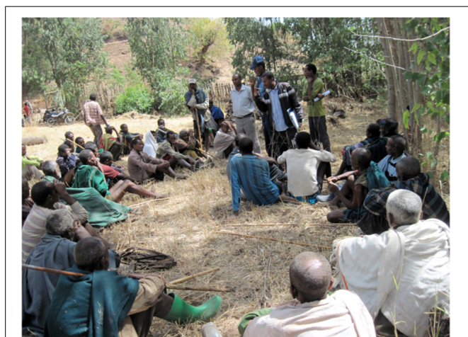
FIGURE 3 | Discussing ecosystem degradation resulting from farmers whose land surrounding the rehabilitated gully being unwilling to share the grass in the Tana Lake Region, Ethiopia.

The case illustrates that a collaborative engagement in a citizen science experiment is achievable in the context of an Ethiopian farmers community, and how citizen-science generated results can have on dynamics of ecosystem management and benefit. Tailoring the design to local decision-making processes improved the relevance and legitimacy of the results, and thus their assimilation. At the same time, it shows the potential risks and pitfalls of altering local balances of resource use. Lastly, despite the straightforward experimental design, the use of educational material such as photos helped in setting up the experiment and creating local buy-in.