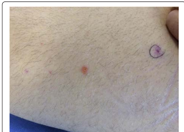
Fig. 3 Eruptions demonstrating generalized herpetic rash at day 8 following intensive care unit admission (left thigh)

In the light of the available literature, HSV-2-induced multiple organ failure is a rare condition. HSV infection in adults is commonly associated with cutaneous facial (HSV-1) or urogenital infections (HSV-2) [4]. Of interest, approximately 60 % of the Western population is HSV-1 colonized, whereas HSV-2 colonization occurs in approximately 12 % of cases [4]. Oral HSV infection in adults may present as severe pharyngitis accounting for approximately 6 % of cases in young adults. However, HSV-2