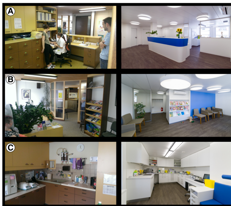
Fig. 1 Panels a , b , and c display the GP office before (left side) and after renovation (right side). a reception, b waiting room, c laboratory. We received consent to publish the pictures from all people on (a)

For 6 weeks, from June 23 until August 8, 2014, the practice was renovated. The entry hall, the reception area, the laboratory where patients give blood, the waiting room, the staff room, and the pharmacy were refurbished (Fig. 1). The consultation rooms were not changed. No new working processes or instruments