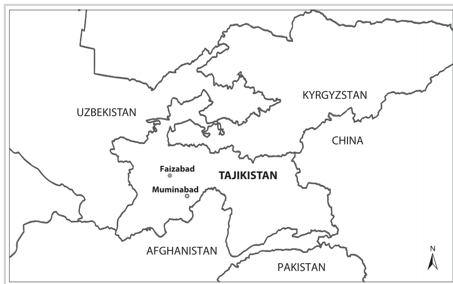
FIGURE 2 Location of the 2 study areas. (Map by Bettina Wolfgramm)

was defined using the area of land managed and number of animals kept—common criteria in similar studies (Shepherd and Soule 1998; Pfister 2003; Shigaeva et al 2007). We divided the smallholders participating in the study into 3 categories: small, medium, and large. For each smallholder category, parameters were derived from the interview data. Stocks and flows of biomass were calculated on the basis of these parameters.