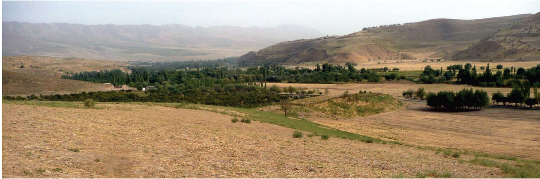
FIGURE 3 A Muminabad landscape typical of the study region with food plains and moderate-to-steep slopes.

In a first step, informal talks with farmers and field observations were carried out to gain the information needed to develop the interview questionnaire; this can be found in the Supplemental Material , Appendix S1 ( http://dx.doi.org/10.1659/MRD-JOURNAL-D-14-00114.S1 ). For use in new regions, the questionnaire needs to be adapted on the basis of the relevant literature, field observations, and informal talks. In a second step, questionnaire-based interviews were conducted with 21 smallholders, 10 in Muminabad and 11 in Faizabad. The study also drew on a complementary data set on household energy consumption, based on interviews commissioned for this study and carried out in 35 households from 2 villages in the Faizabad study area in February 2011.