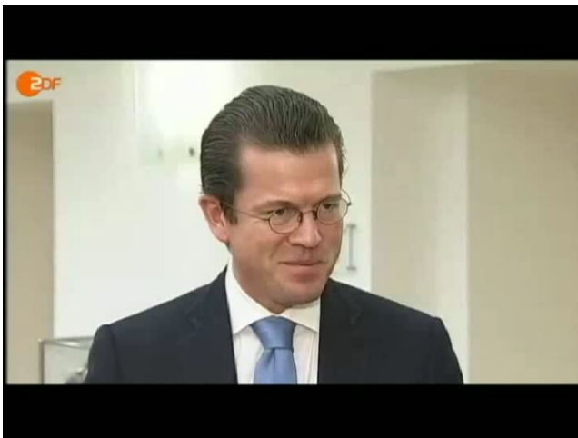
Karl-Theodor zu Guttenberg, February 2011 (German Minister of Defense at that time)