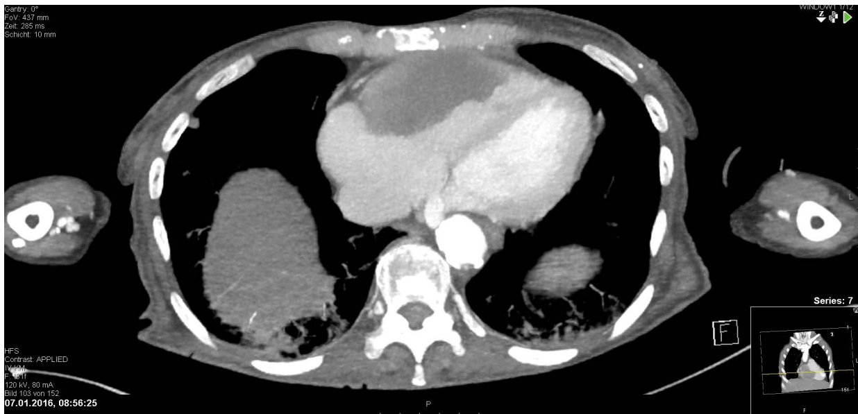
Figure 1: Computed tomography scan of the chest. The asterisk marks the tumor mass. RV = right ventricle, and LV = left ventricle.