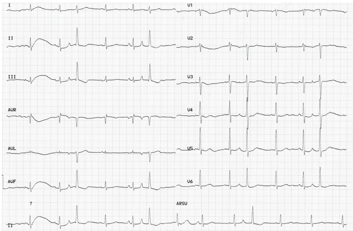
Figure 3: Standard resting 12-lead ECG 6 months before the current presentation without Brugada pattern.

pattern disappeared [9,10]. In our patient, a proof of Brugada phenocopy is missing because reversibility could not be shown. Thus a diagnosis of a Brugada phenocopy cannot be achieved based on these criteria [8]. However, the evolution of the ECG changes over time, the patient's history, and the localization of the mass in the right ventricular wall are highly suggestive for a Brugada phenocopy.