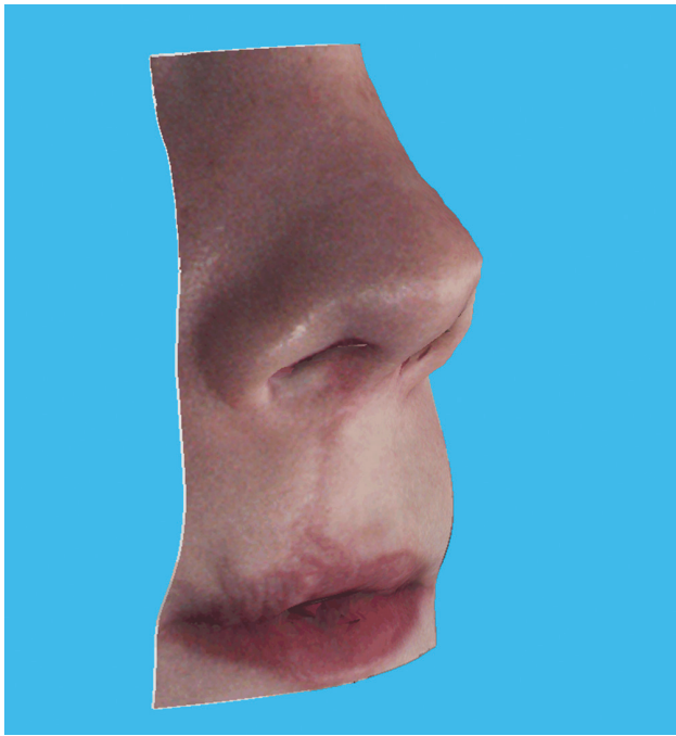
Figure 2. Three-dimensional image of nasolabial area used for rating.

evaluation easier on 2D or 3D images? If the rater put a mark in the middle of the VAS (corresponding with 50 mm), it meant that neither of the methods was more informative or easier for assessment. Placing the mark closer to the left end of the scale (0 mm) meant that 3D images are more informative and easier to evaluate.