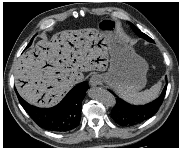
Image 2 and 3. Pneumoportogram in the CT-scan.