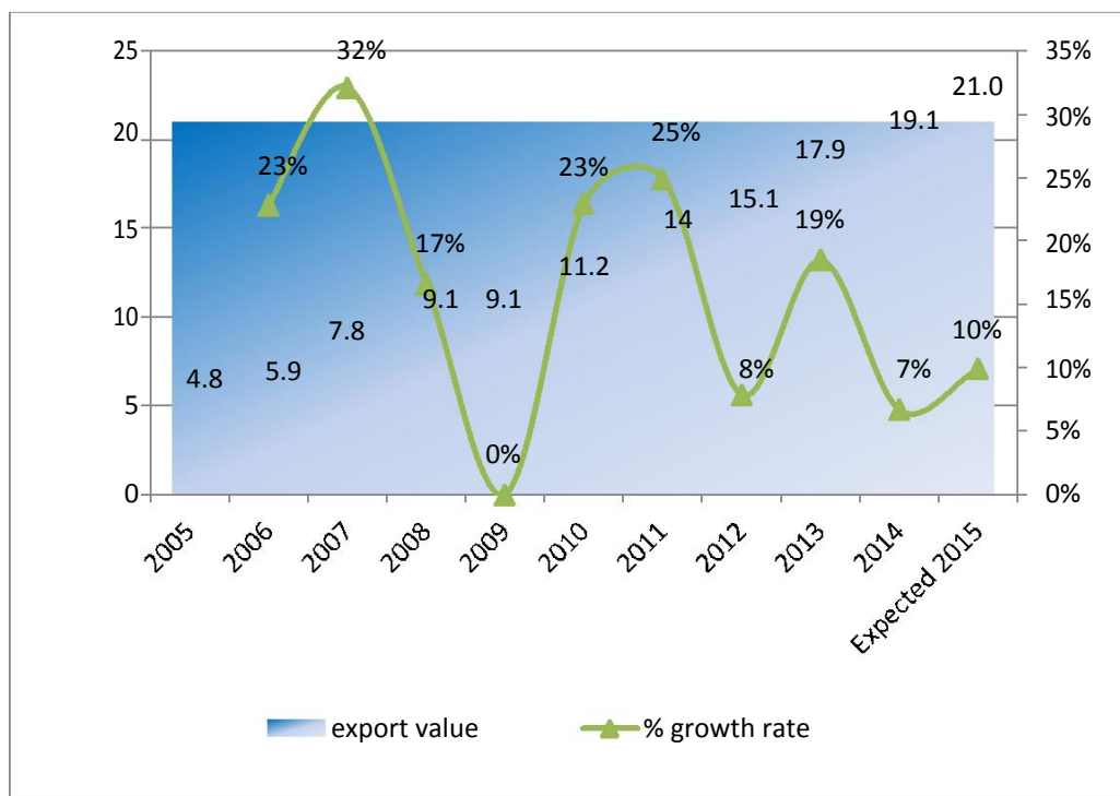
Figure 1: The export value of Vietnam apparel (billion USD)

Figure 1 demonstrates the value of apparel export in Vietnam over an eleven-year period. Apparel export which accounts for most value of textile export, with its turnover increased gradually from $4.8 billion in 2005 to as much as $19.1 billion in 2014. With an impressive total turnover of $135 billion in eleven years, textile in general and apparel in particular currently stand as the second largest export sector of Vietnam. Its annual growth rate was among the highest in the world, at an average of 16% per year.