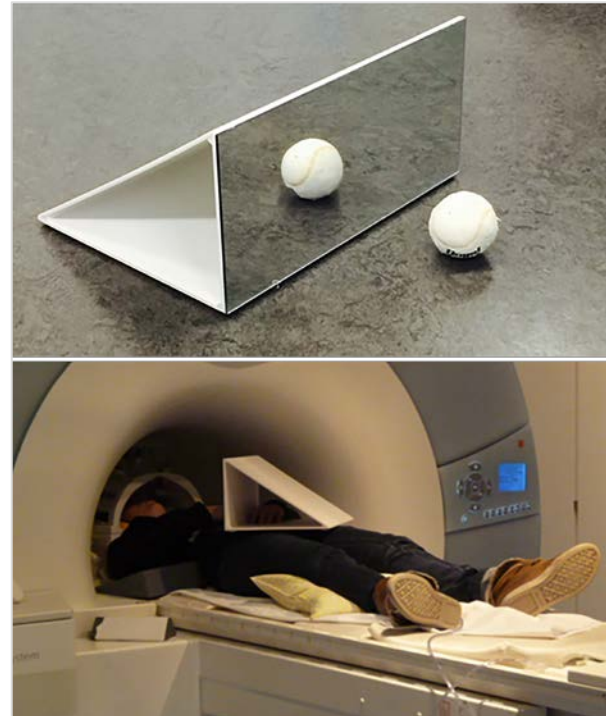
Figure 1: The experimental setting. A customised mirror box made out of plexiglas and wood was used for the experiment (left panel). Patients lay on their back in the scanner with their arms comfortably resting on the scanner table alongside their torso and with their elbows slightly flexed. A mirror was attached to the head coil above the head allowing the participants to view their hands (right panel).

tests, a primary threshold of p < 0.001 at voxel level and a cluster-extent threshold at family-wise error rate (FWER) for multiple comparison correction was used. Age and MACS were used as covariates for patients, age for controls.